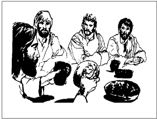
Holy Thursday – The Last Supper